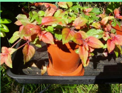
◀ AUTUMNALE – Meteor 1880

This is my favourite ornamental foliage fuchsia. As you can see, the leaves are so bright and colourful. However, very difficult to train into a decent shape – but not impossible!