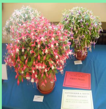
BEST IN SHOW – 2007 'H KILBOURN'

I have also found some photos which I hope you will find interesting!