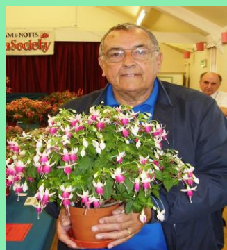
BEST IN SHOW – 2014 'D JOYNT'