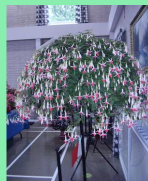
BEST IN SHOW - 2021 'C WOOLSTON'